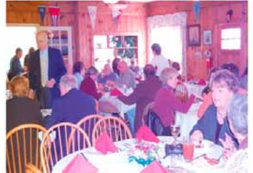
Happy brunchers in the dining room