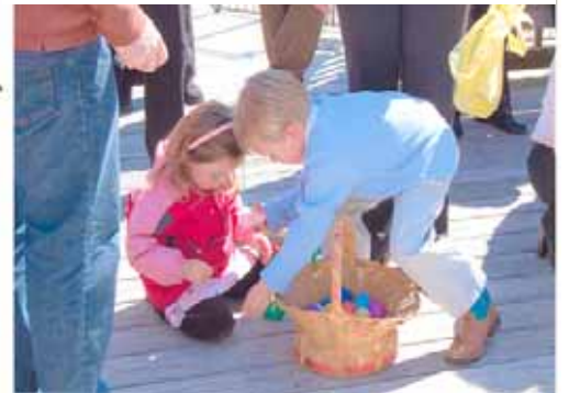
"Let's see what you got..."