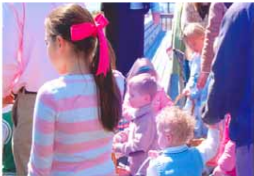
Kids await the "GO!" signal.