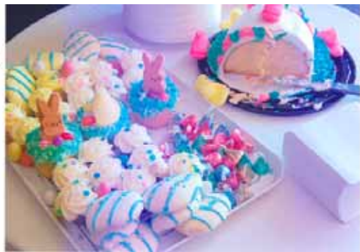
Lo-cal Easter desserts