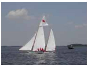
Copyright 2009 — Rock Hall Yacht Club — All rights reserved

Mark your calendars now for the Annual Log Canoe Regatta at RHYC, Sat., and Sun., July 18th and 19th.